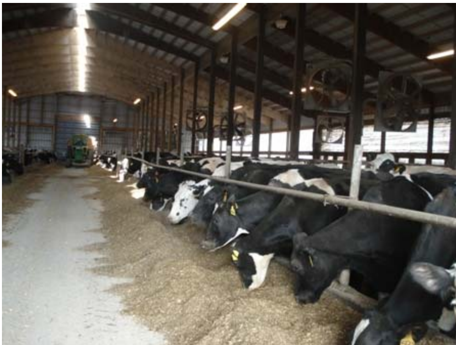
Cows at Tayl-Wind Farm consuming a TMR containing BMR corn silage