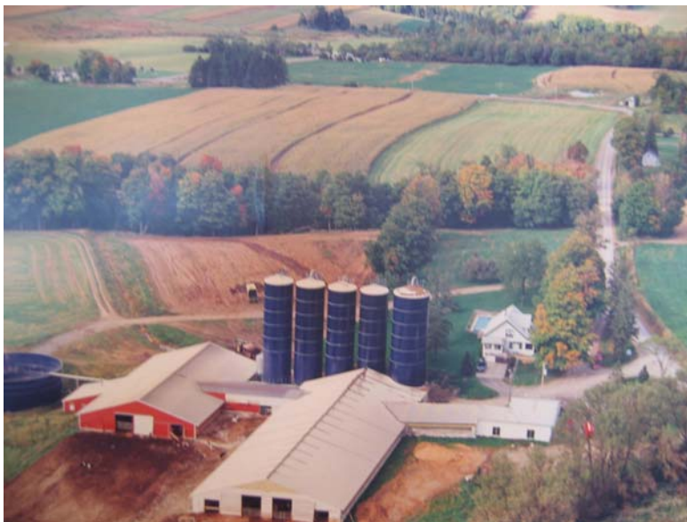
Jerry Dell Farm 1995; Today the Harveststores are gone and 300 acres of pasture surround the farm.